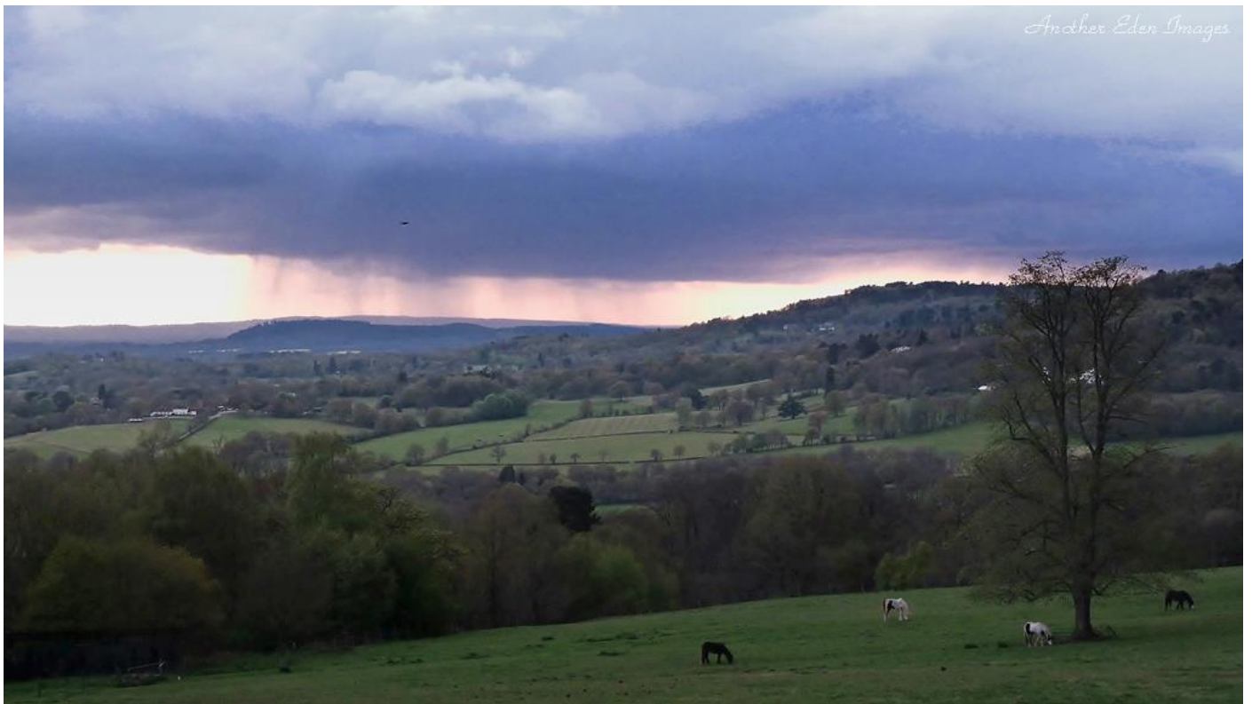
View from Leith Hill, Surrey Hills AONB