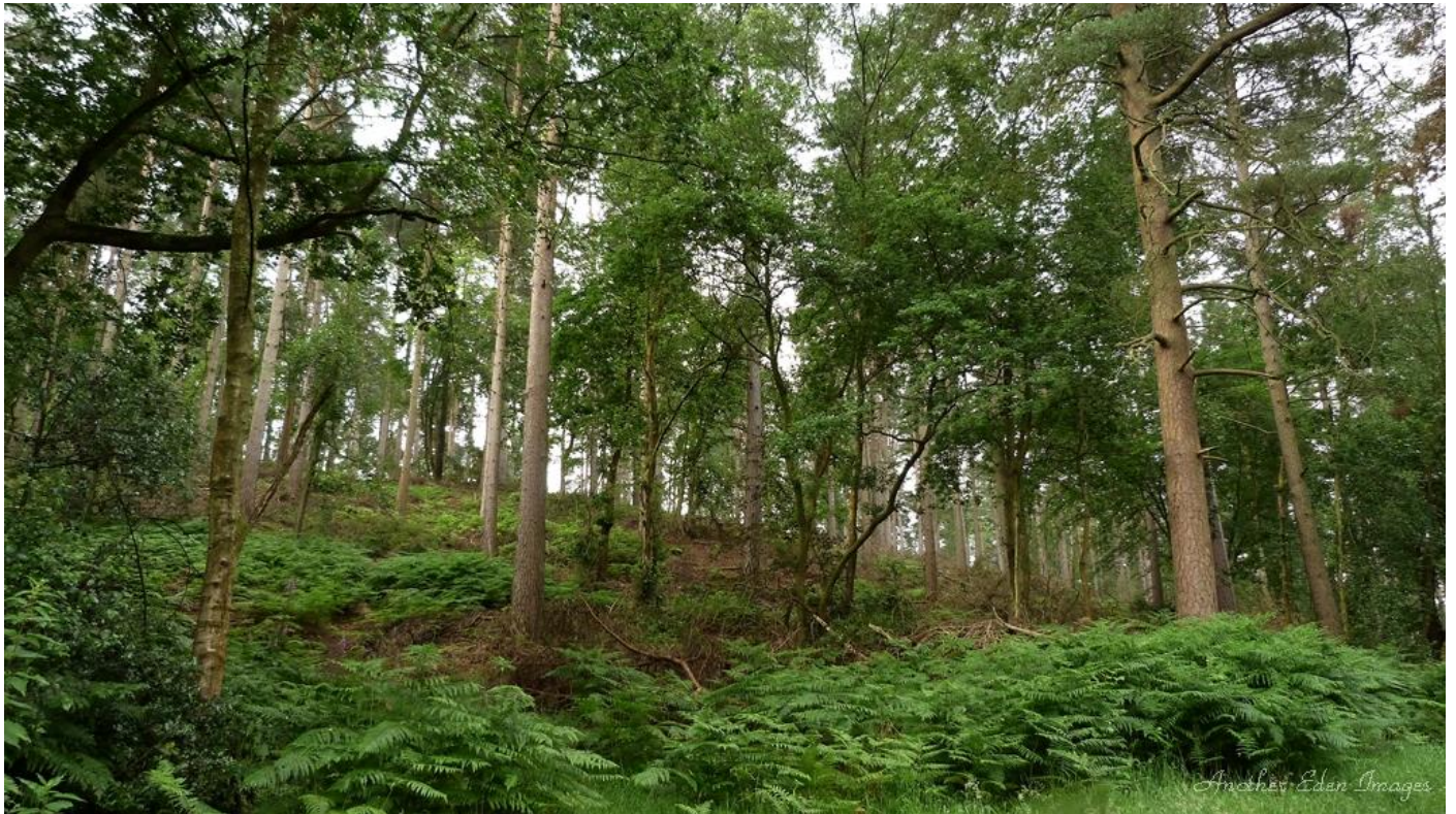
The Hurtwood, Surrey Hills AONB